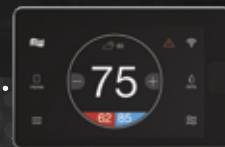
EcoNet Smart Thermostat